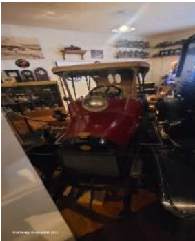
1 person wide with passenger behind driver

Additionally there were some unusual vehicles like the one person-wide car and a body composed of paper mache like material.