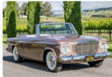
289-Powered 1962 Studebaker Lark Daytona Convertible 4-...