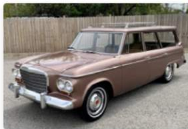
1963 Studebaker Lark Daytona Wagonaire 289 3-Speed