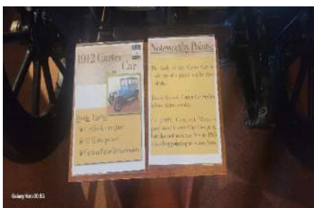
A paper Mache Body?? Really!!!!