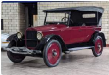
1923 Studebaker Model EM Light Six Touring

CLICK here to load all the Studebaker auctions from Bring A Trailer including 1 live auction at the time of writing, a 1948 Champion Deluxe in green ending on 6-15!