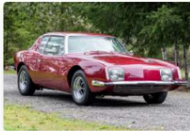
1964 Studebaker Avanti R1