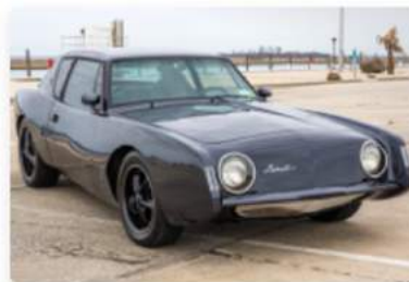
327-Powered 1963 Studebaker Avanti