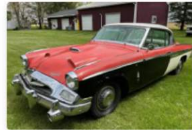
Cadillac 365-Powered 1955 Studebaker President Speedster 3-...