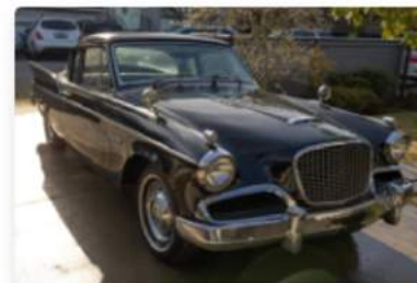
32-Years-Family-Owned 1957 Studebaker Silver Hawk Project