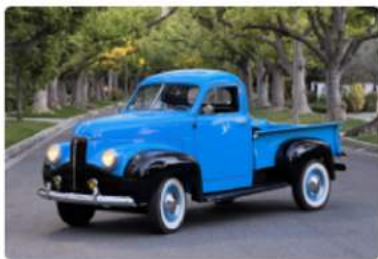
1946 Studebaker M5 Pickup 5-Speed