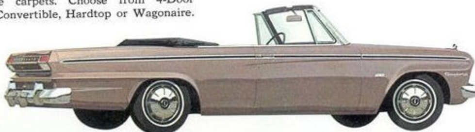
Daytona/ Studebaker's spirited fun car

Daytona delivers all the famous Studebaker extra value features plus rousing Power Thrust 259 V8! Interiors are luxurious tasteful nylons or colorful, glove-soft vinyl and deep-pile carpets. Choose from 4-Door Sedan, Convertible, Hardtop or Wagonaire.