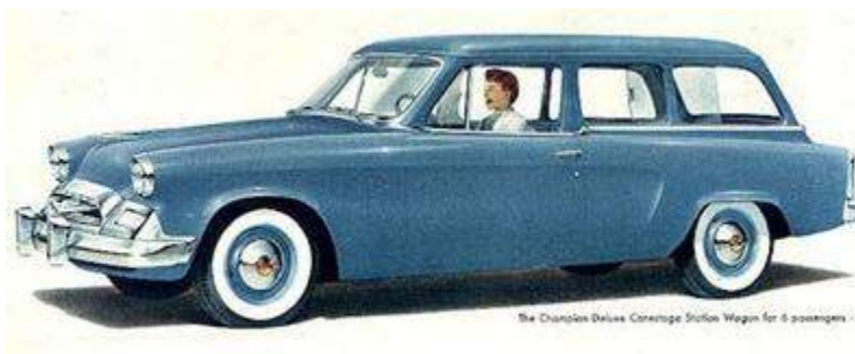
1955 Studebaker Champion Deluxe Conestoga Ad