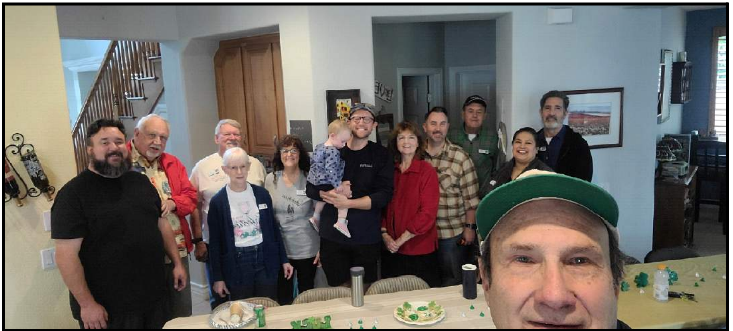
NICE TURN OUT FOR OUR ANNUAL CHILI COOK OFF CONTEST