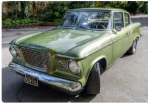
1960 Studebaker Lark VIII Deluxe 2-Door Sedan

Some cool Stude's crossed the Auction Block recently. Here's a few that caught my attention.