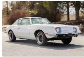
1976 Avanti II