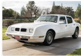
1990 Avanti 4 Door Touring Sedan